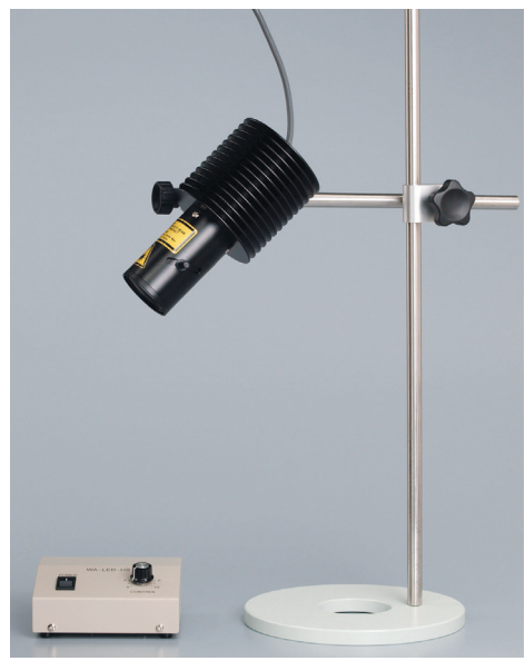
High-intensity LED with a wide illuminance area. Not available in some countries including Republic of Korea • Manufacturer : HAYASHI WATCH-WORKS CO.,LTD.