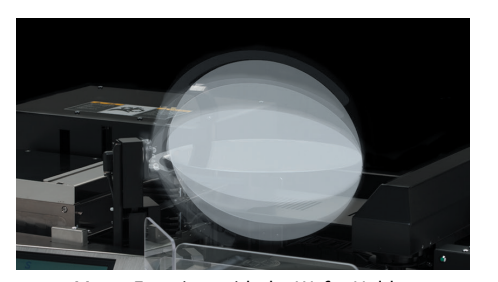
Macro Function, with the Wafer Holder Tilting Angle at 360 Degrees (Simulation)

Macro inspection (LMB) now features a 360-degree selfrotating function for a complete macro inspection of the wafer. This allows for easy identification of defects and particles on the wafer surface for both the top and backside surfaces. In addition, top macro inspection includes up to 30 degrees of tilt using the integrated joystick.