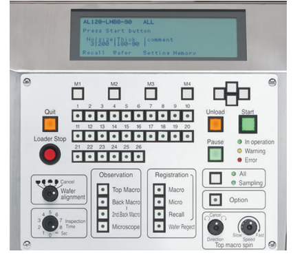
Control Panel and LCD Display

An LCD display provides the operator with the ability to visually configure inspection recipes and sequences, as well as confirm set-up conditions. Inspection results, including operator input of micro and macro defects, are displayed on the LCD for operator review.