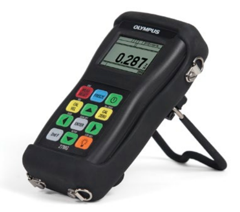
27MG with the optional Protective Rubber Boot with Neck Strap and Gage Stand

Standard inclusions may vary depending on your location. Contact your local distributor.