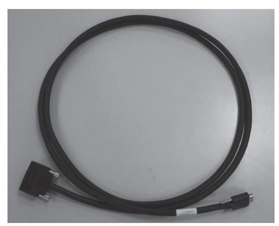
Camera Link cable 2m