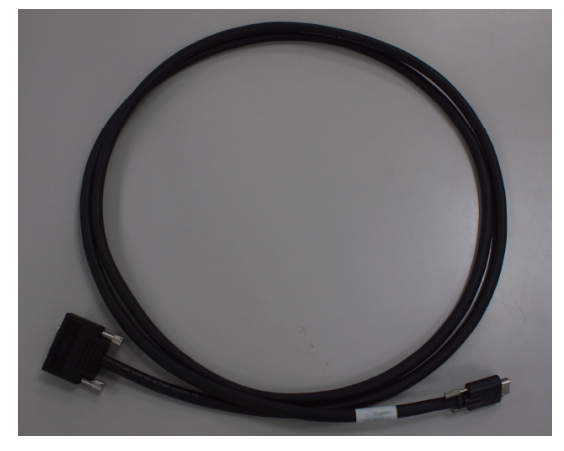
Camera Link cable 2m