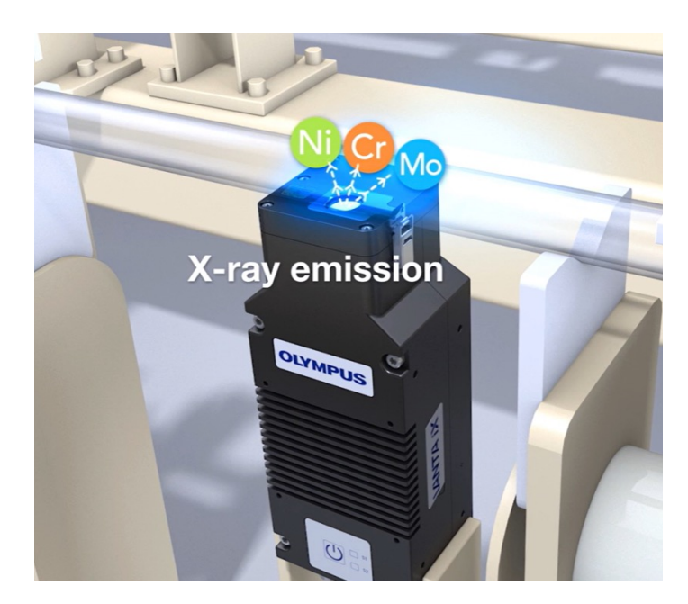
Example of the Vanta iX material verification system testing a fabricated metal pipe on a cross transfer table.