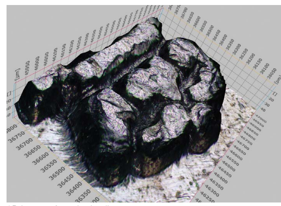
3D image of a coin detail

Using the BX61, users can quickly acquire and combine images for samples that extend beyond the depth of focus. The EFI image combines all of the individual focus levels into a single 3D image at the touch of a button. The resulting 3D data set can be used for 3D visualization or simple measurements of heights and distances.