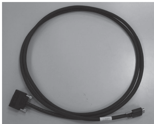
Camera Link cable 2m