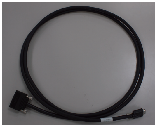
Camera Link cable 2m