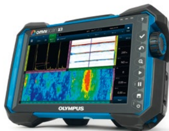
OmniScan X3 phased array flaw detector